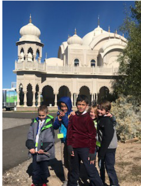
2nd Grade Field Trip to Hare Krishna Temple