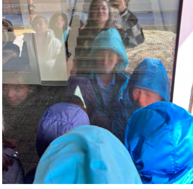
Some 5th grade studnets hiding from the wind at recess!