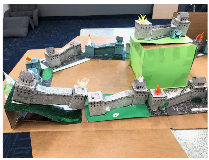
Ms. Sun's 6<sup>th</sup> grade class built models of the Great Wall!