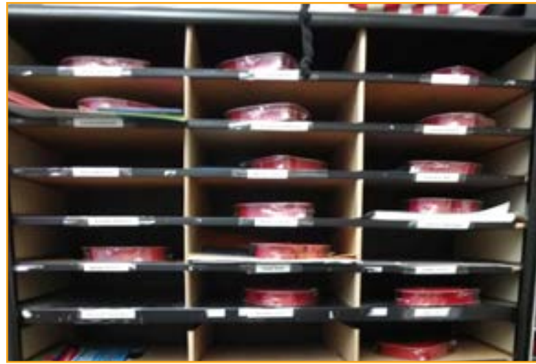
Someone (fellow staff or parent - we aren't sure) put a Valentine's treat in everyone's box anonymously! Sure made our day.