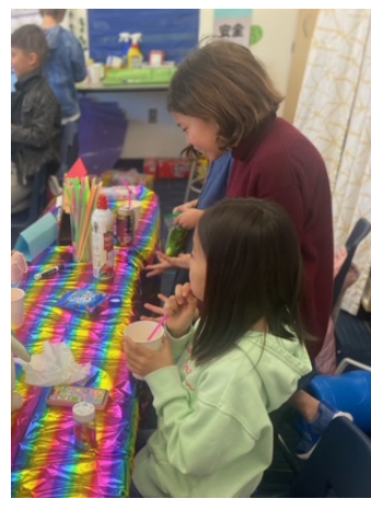
5th Grade - Field trip to the University of Utah