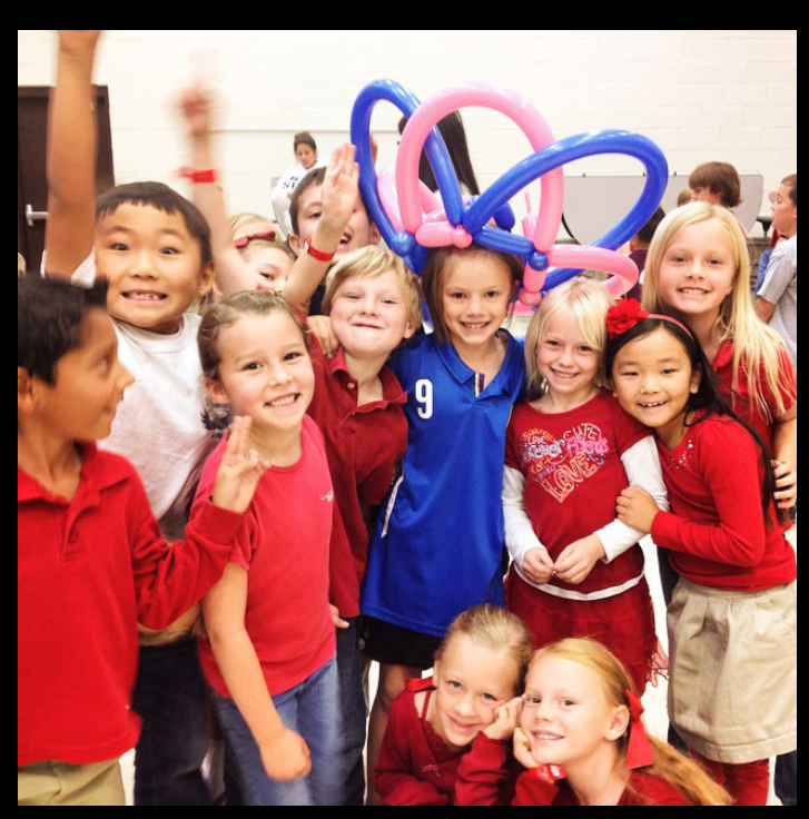
Renaissance students had a great time at the Red Ribbon Week assembly last Friday.

The quality of a person's life is in direct proportion to their commitment to excellence, regardless of their chosen field of endeavor.